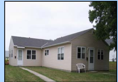
Buck Road Duplex, Middletown

Washington Square Residential Programs Bridgeview Condominiums Bayside Village Apartments Independent Living Apartment Program