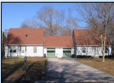
Forest Avenue Condominiums, Middletown