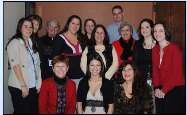
Quality Improvement Services Staff