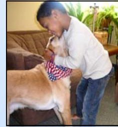
Pet Assisted Therapy has proven to be a very successful element in treatment services