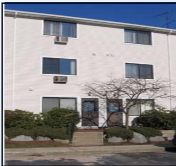
Bridgeview Condominiums, Newport