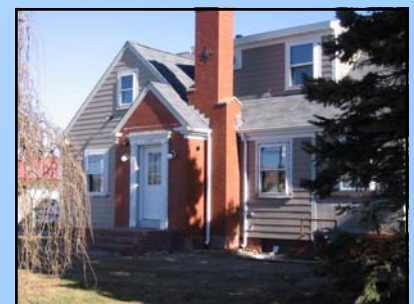
Freedom Apartments, Middletown