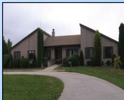
Anita Jackson House, Middletown